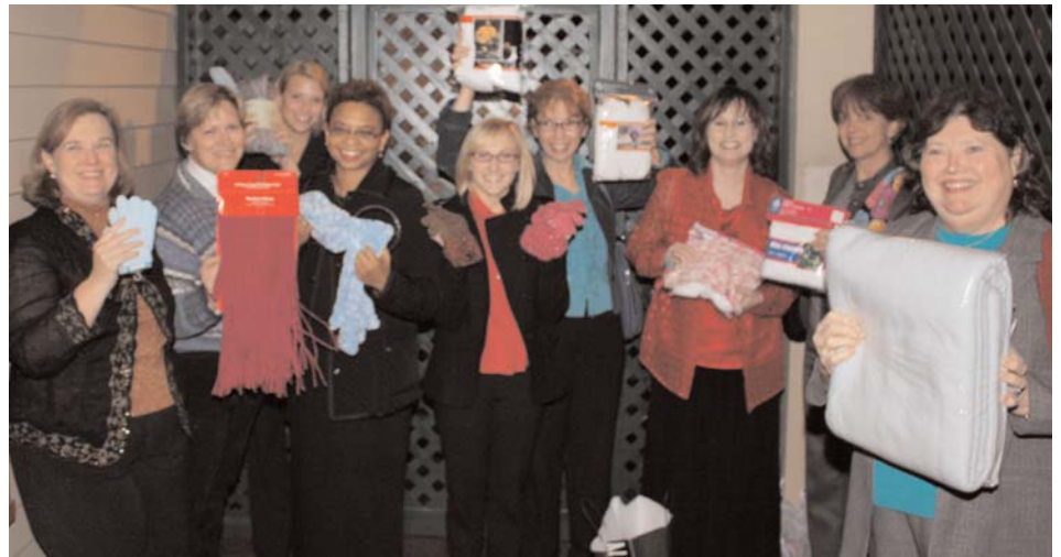
Members collected nearly 200 HUGSS and dropped them off at The Lattice Inn during the Christmas Party.

A good estimate of all three drives combined would be around 500 items donated to the food bank this year by our members.