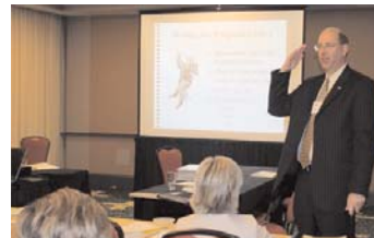
APR Boot Camp