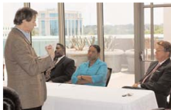
The media panel during one of the chapter luncheons.