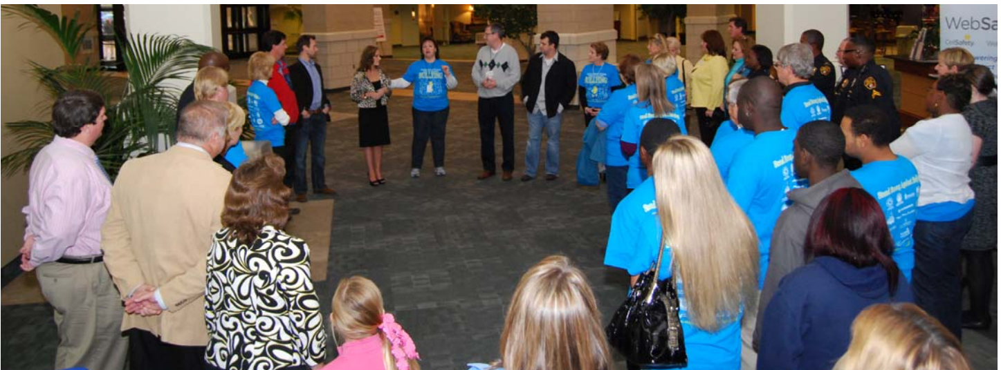
Volunteers gather to thank everyone for supporting the Montgomery Stands Strong Against Bullying town hall meeting.